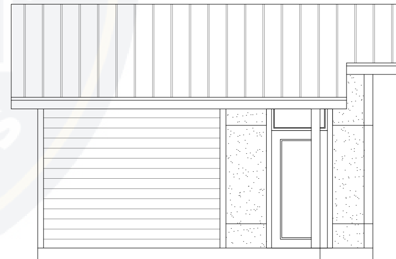
○ LEFT ELEVATION SCALE: 3/16'' = 1'-0''