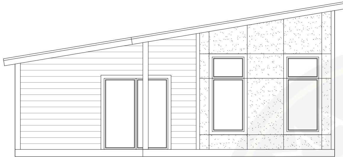
○ FRONT ELEVATION SCALE: 3/16'' = 1'-0''